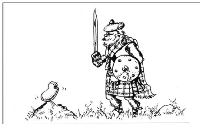
Trying to capture the illusive haggis.