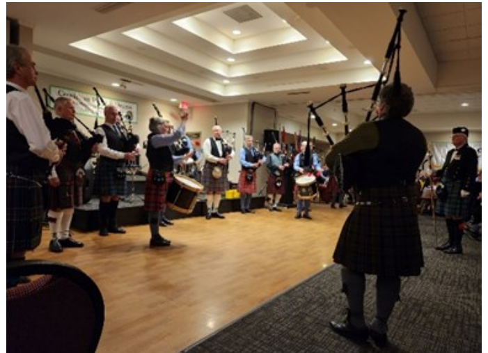
Cowichan Pipes and Drums.