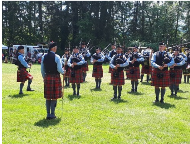
Canada Day – Forest Discovery Centre